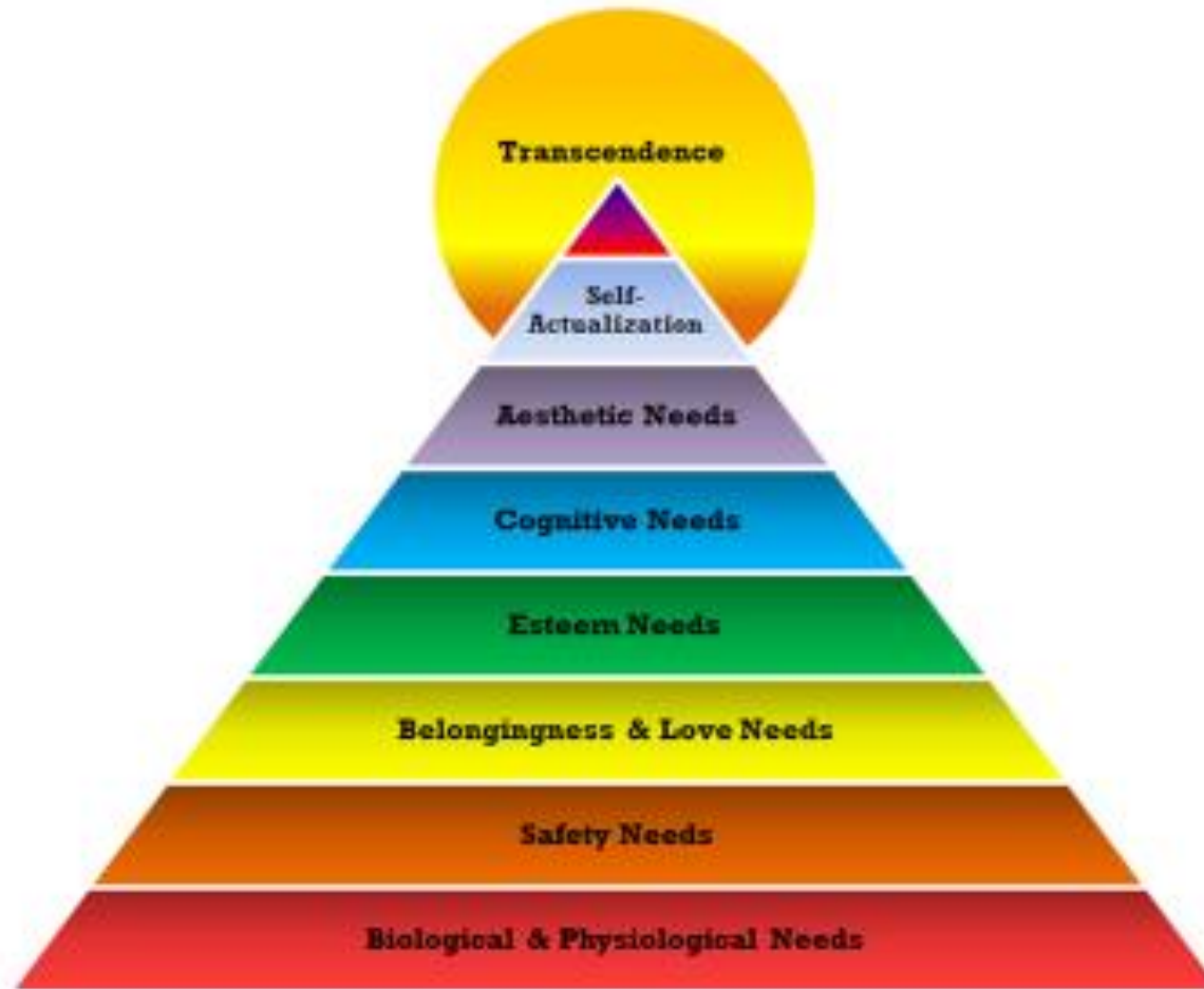
Maslow's Hierarchy Of Needs Pyramid